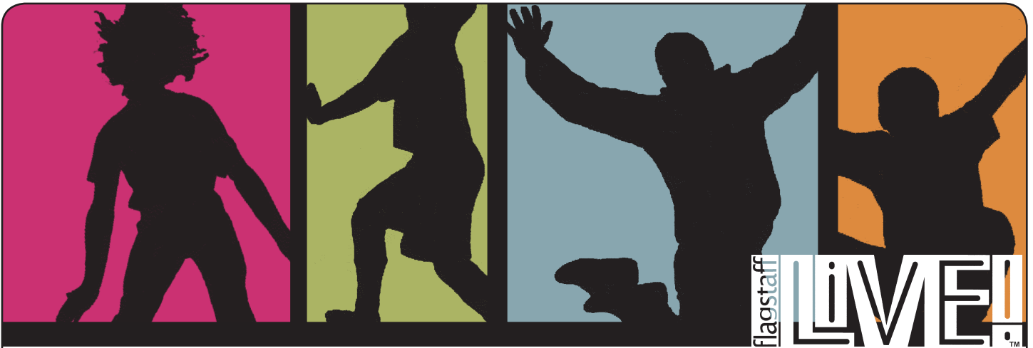
TABLE OF CONTENTS TILE ADS

We will have color title ads (eight of them fit in a tall quarter-page ad) that will run next to our table of contents. This will allow you to refer to your ad and featured specials. We'll even have the page number of your ad. $40 charge on top of the price of your ad.